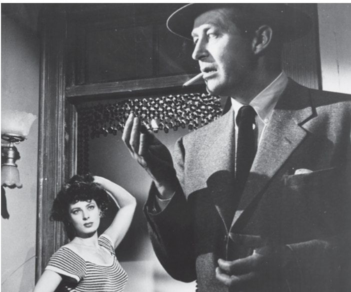
Rita Gam distracts spy Ray Milland in the Cold War noir The Thief

The same year saw the release of Split Second . An escaped killer (Steve McNally), portrayed as intelligent yet utterly amoral, holds a group of