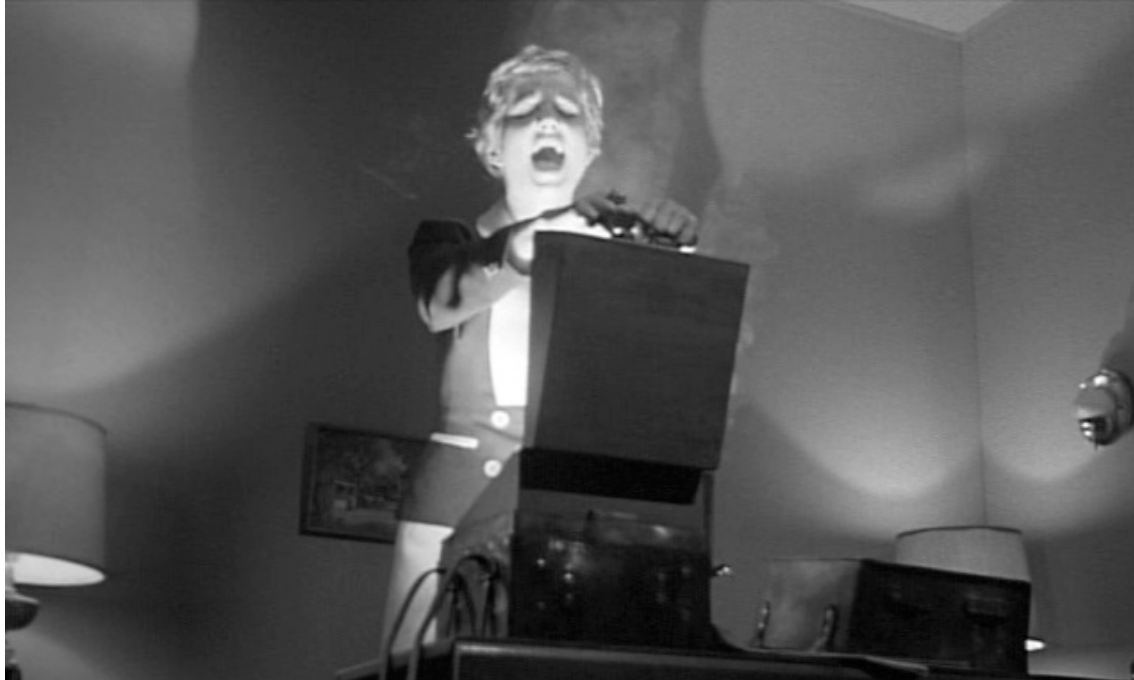
At the climax of Kiss Me Deadly , Gaby Rogers unleashes an atomic maelstrom on Los Angeles

More atomic secrets are covertly sought in Shack Out on 101 (1955), by a Communist named Slob, played by Lee Marvin. This cheapie also has an undercover FBI agent (Frank Lovejoy), for good measure. Shack Out on 101 dips into comedy due to the sheer wildness of Lee Marvin's behavior and the diverse antics