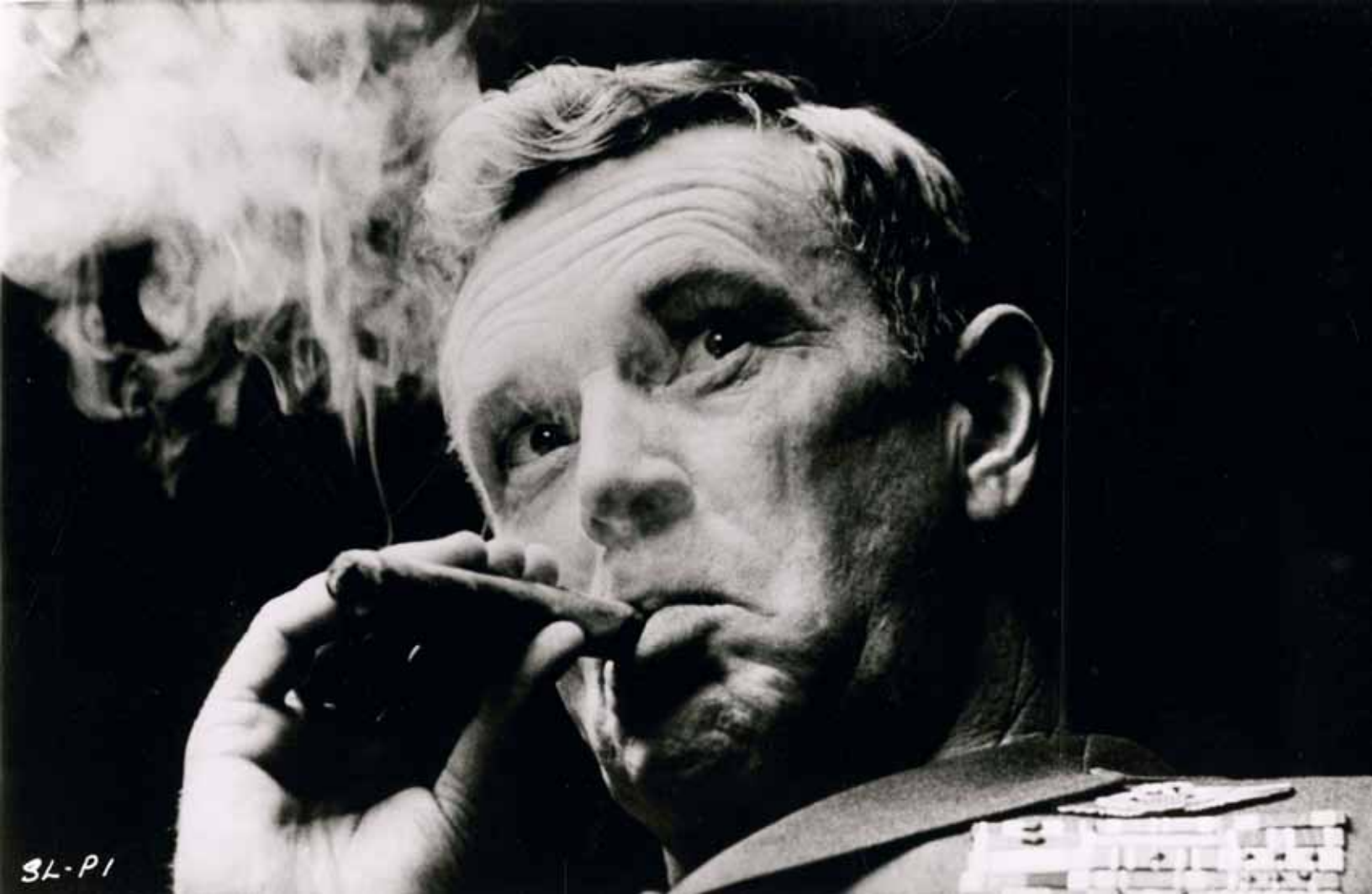
Gen. Jack D. Ripper (Sterling Hayden) advocates nuclear strikes in Stanley Kubrick's black comedy masterpiece Dr. Strangelove ...

adopting the theme of nuclear annihilation during the early atomic era. The Japanese exorcised their atomic trauma in Gojira (Godzilla, 1954), a film whose original Japanese version made clear who had unleashed this madness—America—and, with it this crazy monster Godzilla, who emerges from the ocean to destroy Japanese cities.