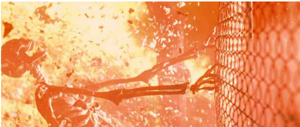
... and the devastating carnage is eventually visualized onscreen in Terminator 2: Judgment Day

This “burnt-to-a-crisp” aesthetic now predominates, as American post-apocalyptic literature, mixed into a stew with various flavorings of paranoid nostalgia, has taken root and criss-crossed into all genres. While the world itself has edged away from nuclear meltdown, celluloid destruction by any and all means has taken up the slack. It has proven to be a formidable—and terrifying—growth industry. ■