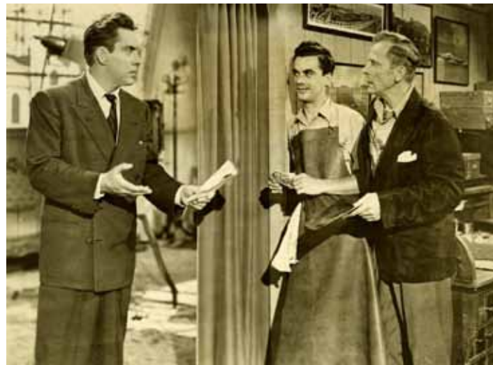
Death by irradiation claims its first U.S. movie victim: Edmond O'Brien in D.O.A.

The palpable fear of complete annihilation by a fiery wind, i.e., destruction by a thermonuclear blast, permeated America in the 1950s, particularly after the explosion of the much more powerful H-bomb. Annihilation seemed a possibility, a very real one. In that early atomic era, it was unthinkable to treat the subject in any way but a serious manner. Films dealing with the actual nuclear blast, the violence of the explosion, white heat and fire, annihilation and pure destructive power were few but highly effective in the early 1950s.