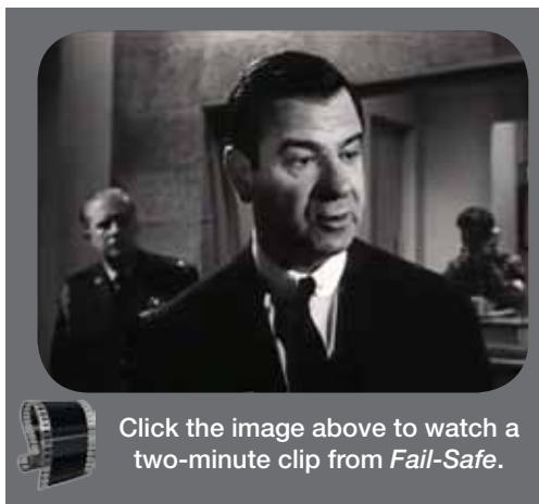
Click the image above to watch a two-minute clip from Fail-Safe .

Science fiction came into the breach. If nothing else, this genre could show without qualms the terror of ultimate destruction,